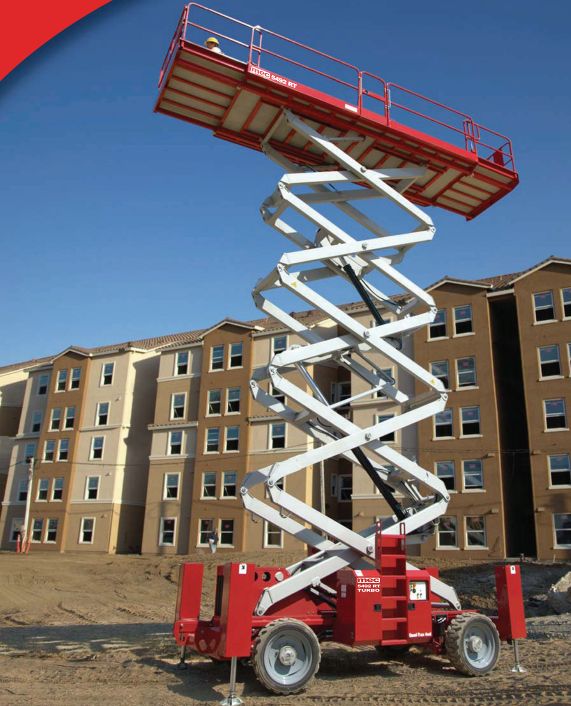
The largest scissor lift made in North America!